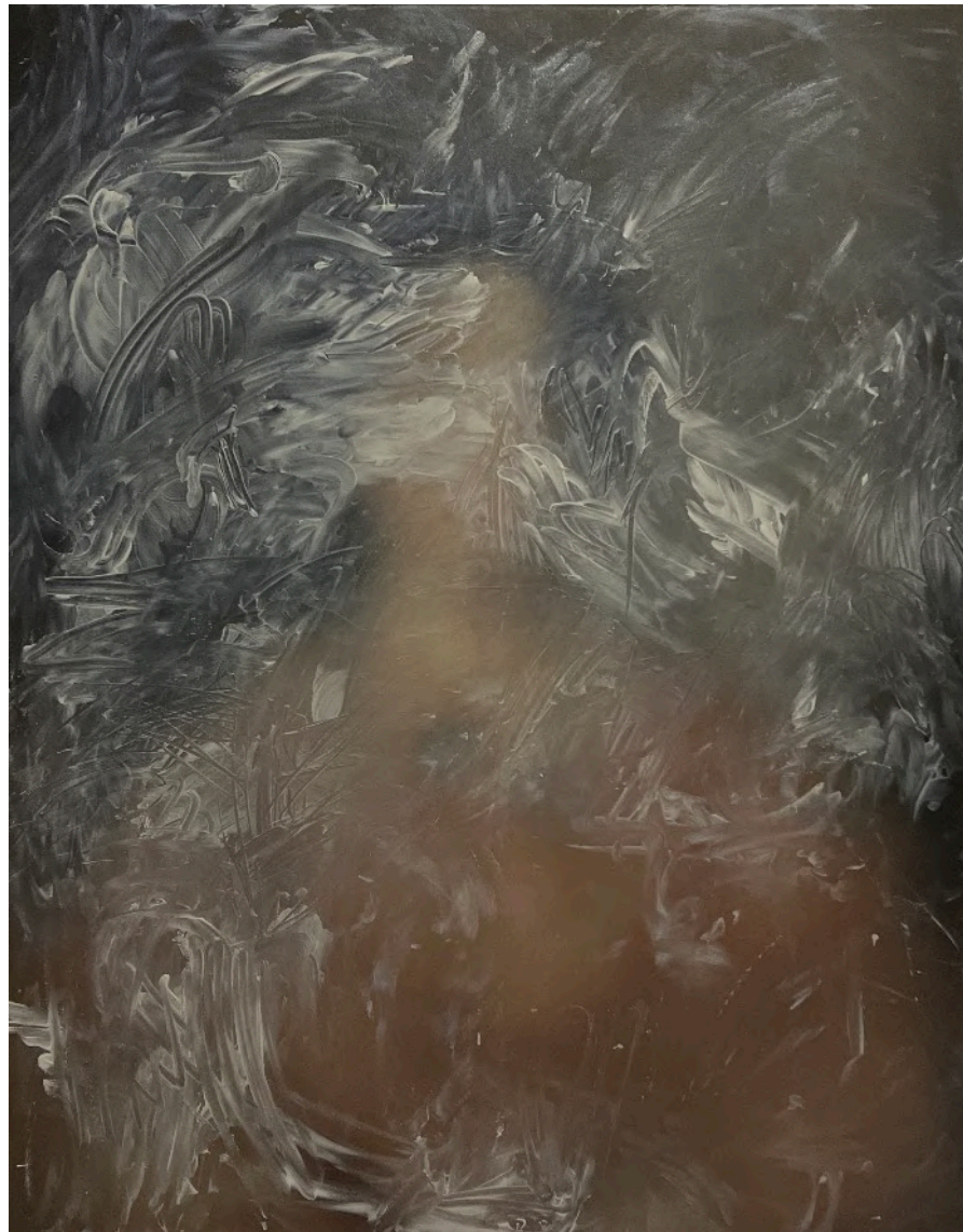
Lia Kimura, Soul , 2021, Oil on canvas, 100 cm x 80 cm