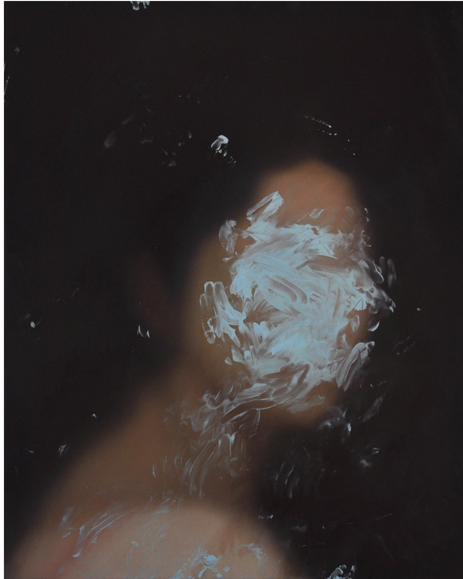
Lia Kimura, Brightness , 2023, Oil on canvas, 100 cm x 80 cm