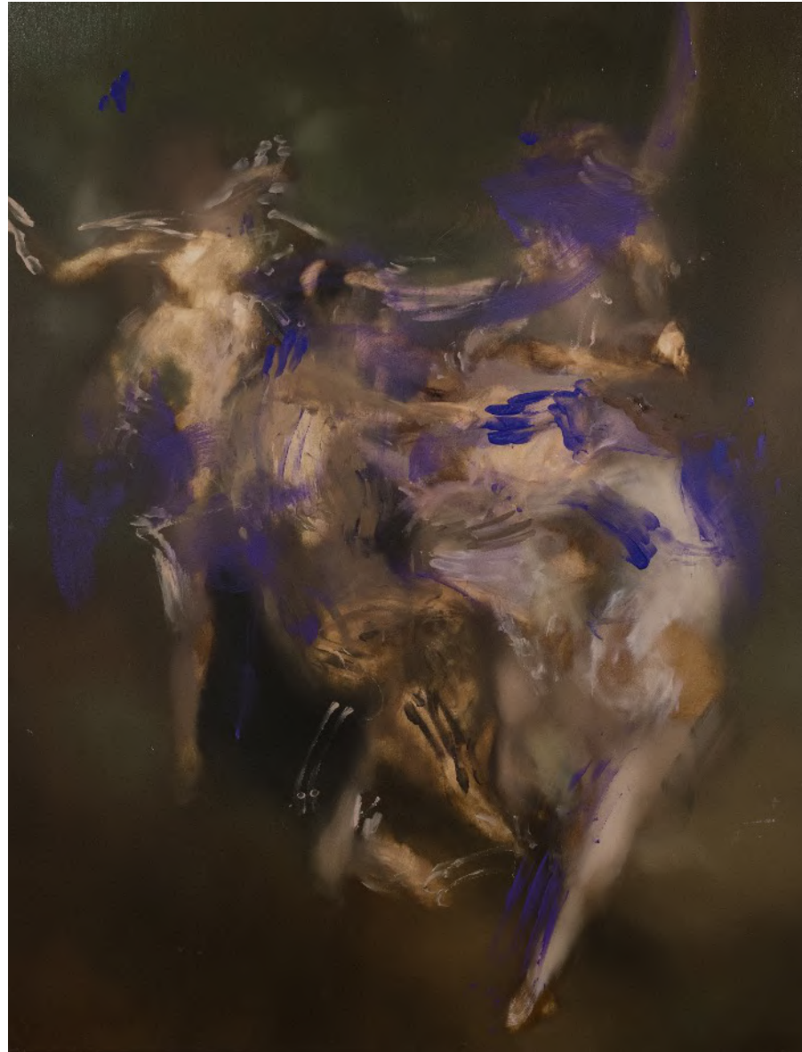
Lia Kimura, Disintegration , 2021, Oil on canvas, 120 cm x 100 cm