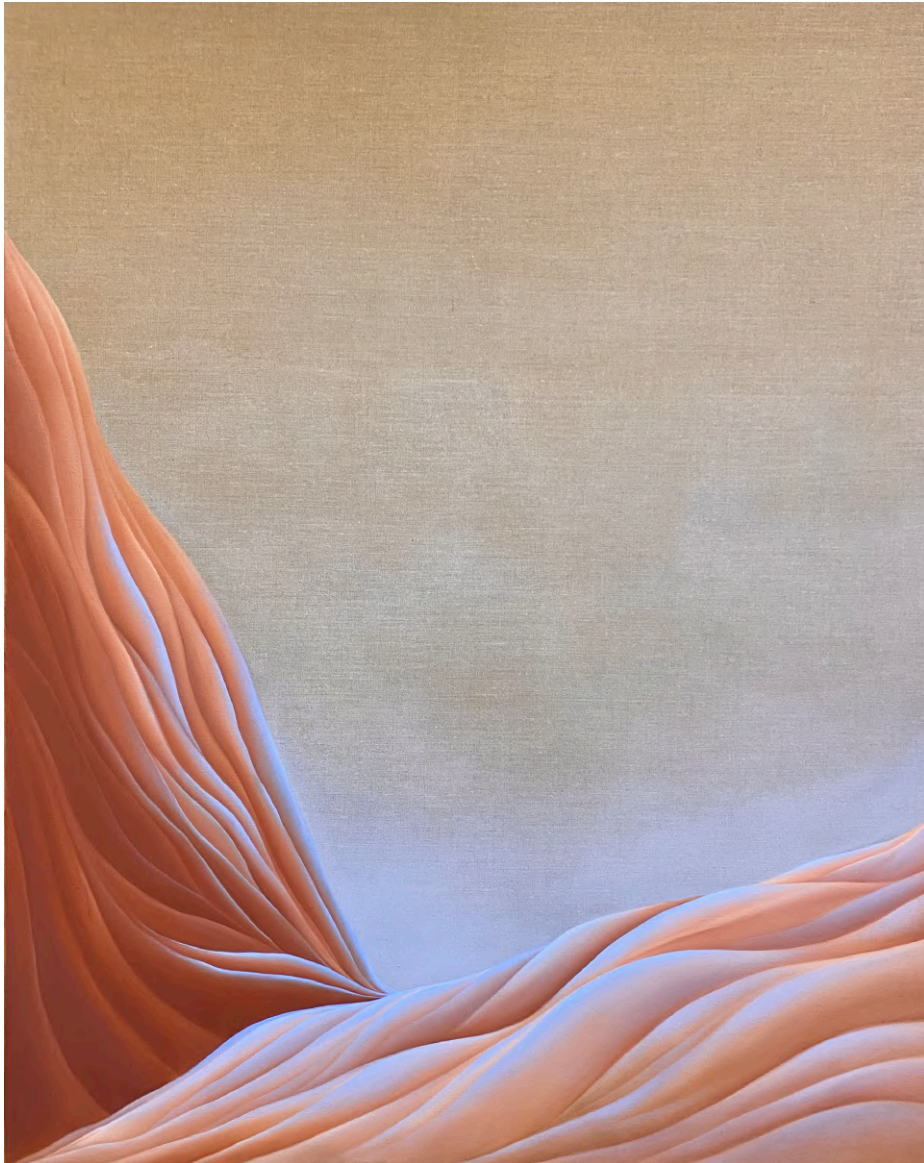
Berenika Kowalska, Untitled , 2021, Oil on canvas, 150 cm x 120 cm.