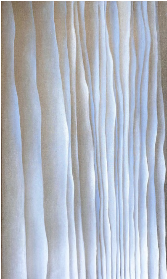
Berenika Kowalska, Untitled , 2020, Oil on canvas, 100 cm x 60 cm.