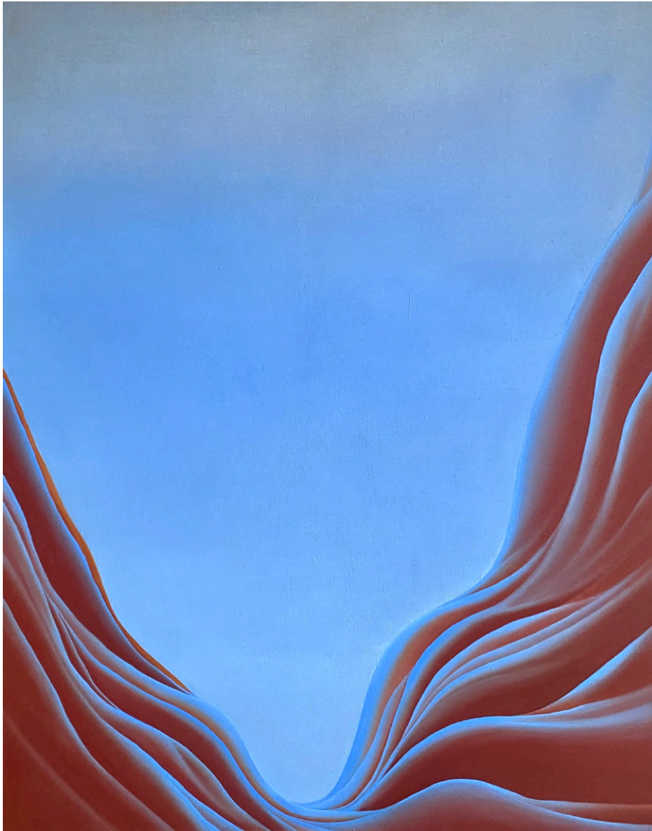
Berenika Kowalska, Untitled , 2021, Oil on canvas, 120 cm x 150 cm.