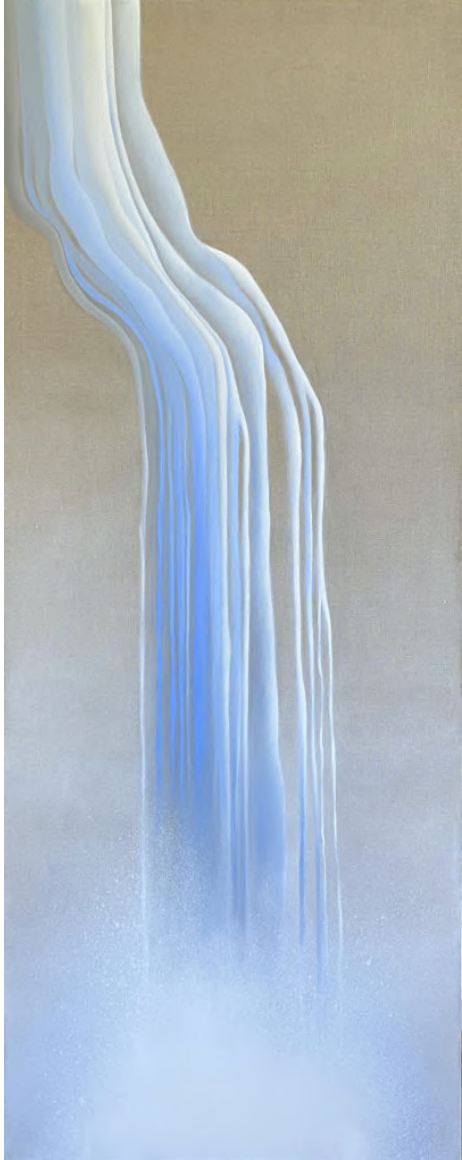
Berenika Kowalska, Untitled , 2020, Oil on canvas, 200 cm x 80 cm.