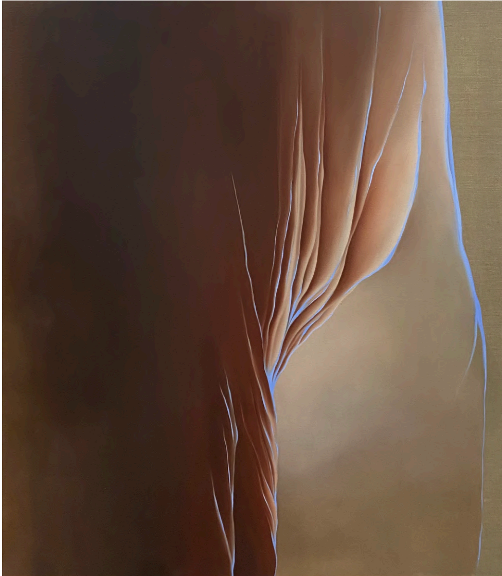
Berenika Kowalska, Untitled , 2021, Oil on canvas, 150 cm x 130 cm.