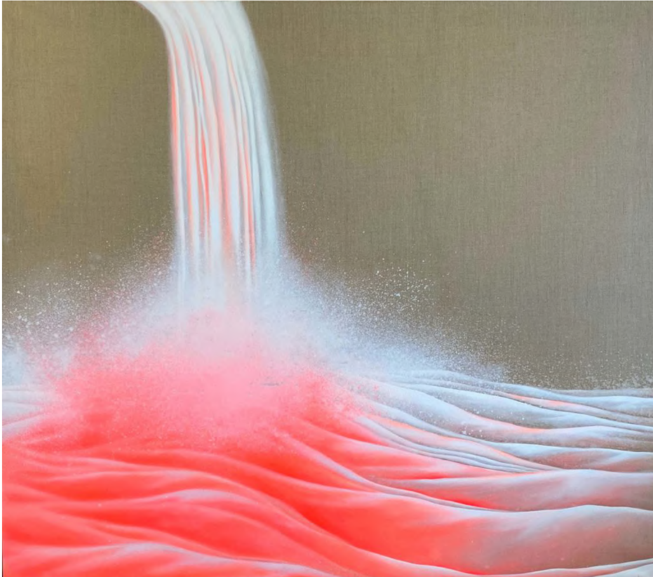
Berenika Kowalska, Untitled , 2019, Oil on canvas, 150 cm x 170 cm.