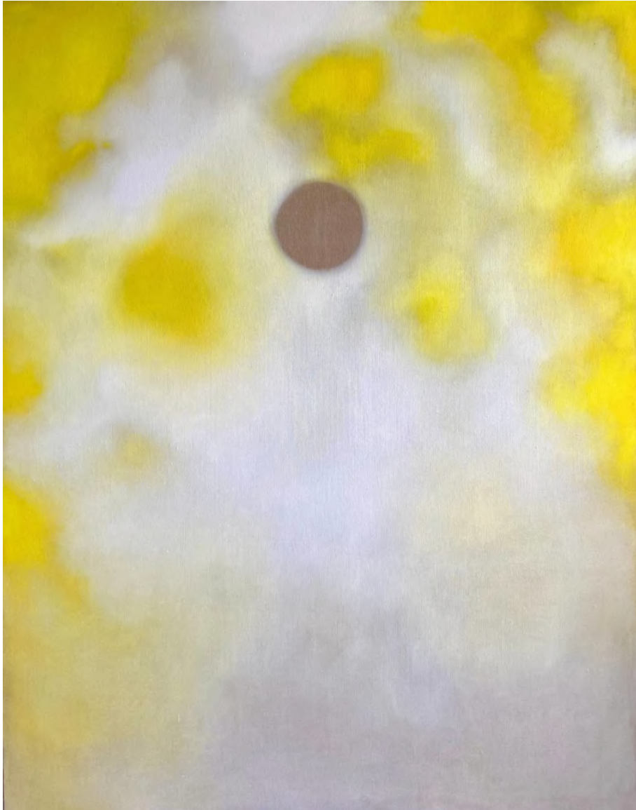
Berenika Kowalska, Untitled , 2020, Oil on canvas, 190 cm x 150 cm.