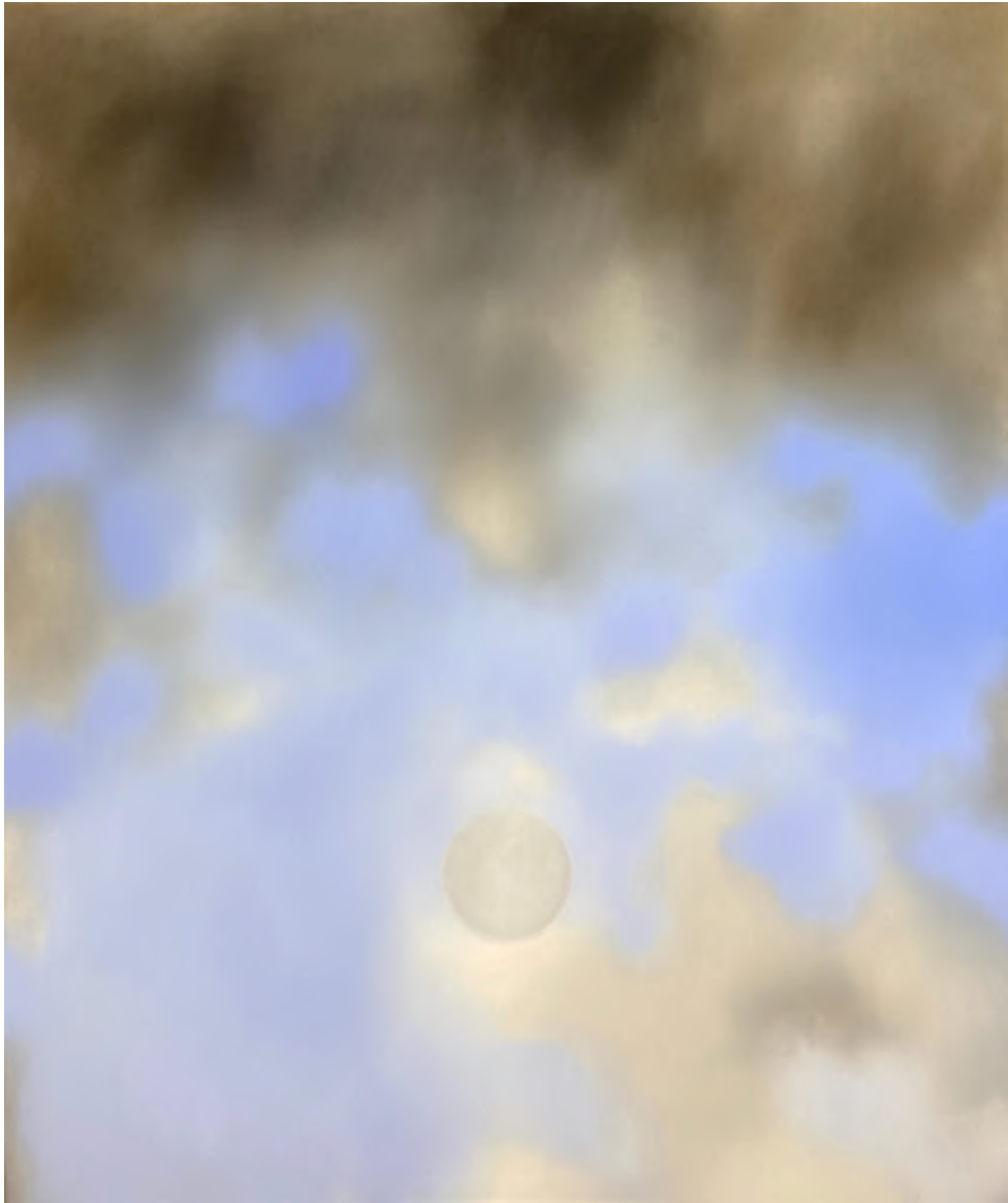
Berenika Kowalska, Untitled , 2020, Oil on canvas, 190 cm x 160 cm.